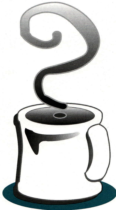
Illustration by Marty Tatum of Ice House Graphics

It is easy to see that this is true. Simply observe that when the product is multiplied out, the terms are all the divisors of m . Things can be simplified a little by applying the formula